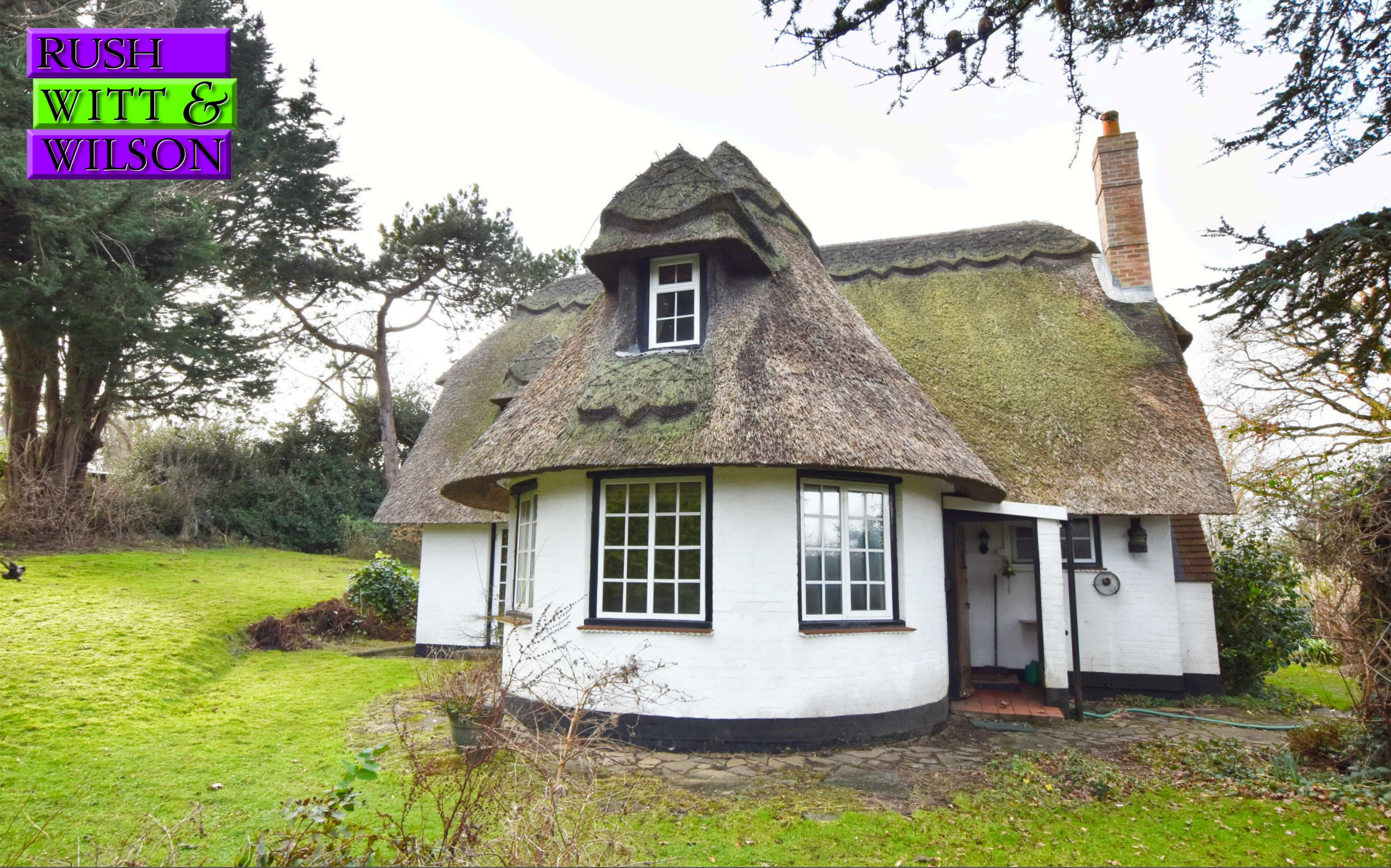
Little Thatches Cliff End Lane, Pett Level, East Sussex TN35 4EF Guide Price £695,000